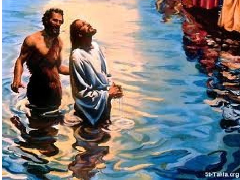
The Baptism of Jesus by John the Baptist

“This is My beloved Son in whom I am well pleased.”