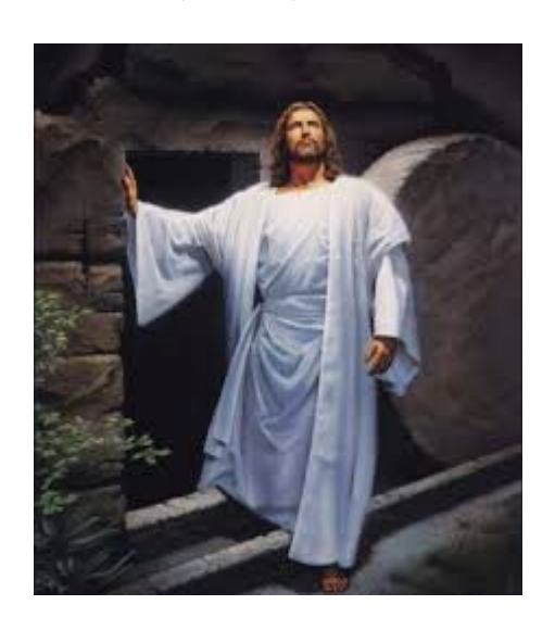
"Because I live, you shall live also."

He is arisen! Glorious word! Now reconciled is God, my Lord; The gates of heaven are open. My Jesus did triumphant die, And Satan's arrows broken lie, Destroyed hell's direst weapon. Oh, hear; What cheer! Christ victorious Riseth glorious, Life He giveth He was dead, but see, He liveth! Amen.